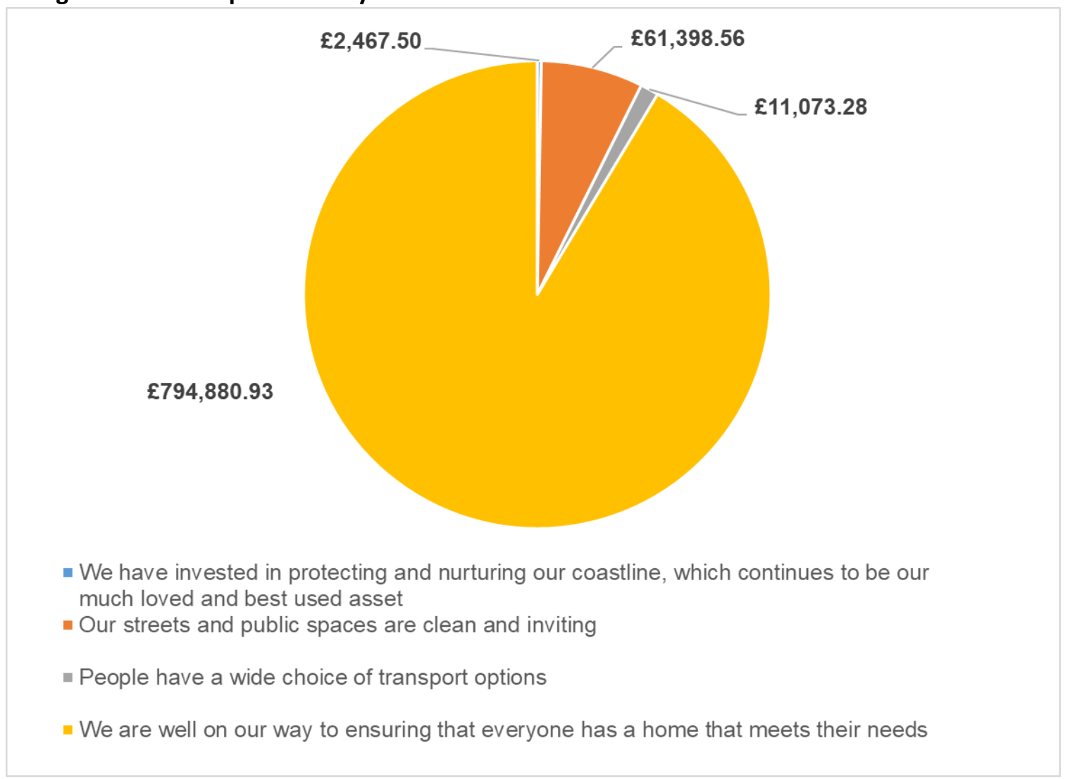
▼ Figure 3: S.106 expenditure by 2050 Outcomes